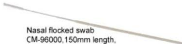
Nasal flocked swab CM-96000,150mm length, 80mm break point