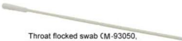
Throat flocked swab CM-93050, 152mm length,80mm break point