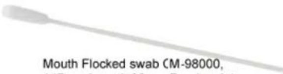
Mouth Flocked swab CM-98000, 147mm Length,30mm Break point